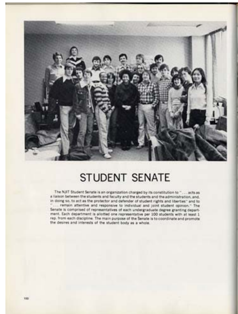
[ Student Senate from 1980 yearbook ]